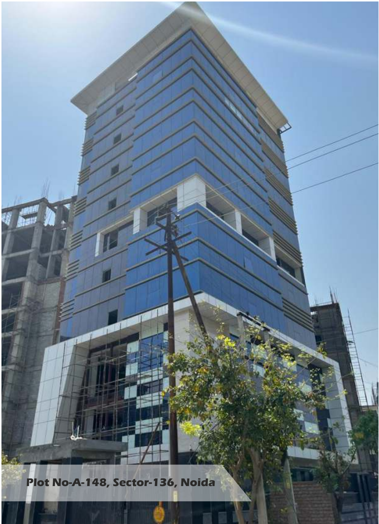
Plot No-A-148, Sector-136, Noida