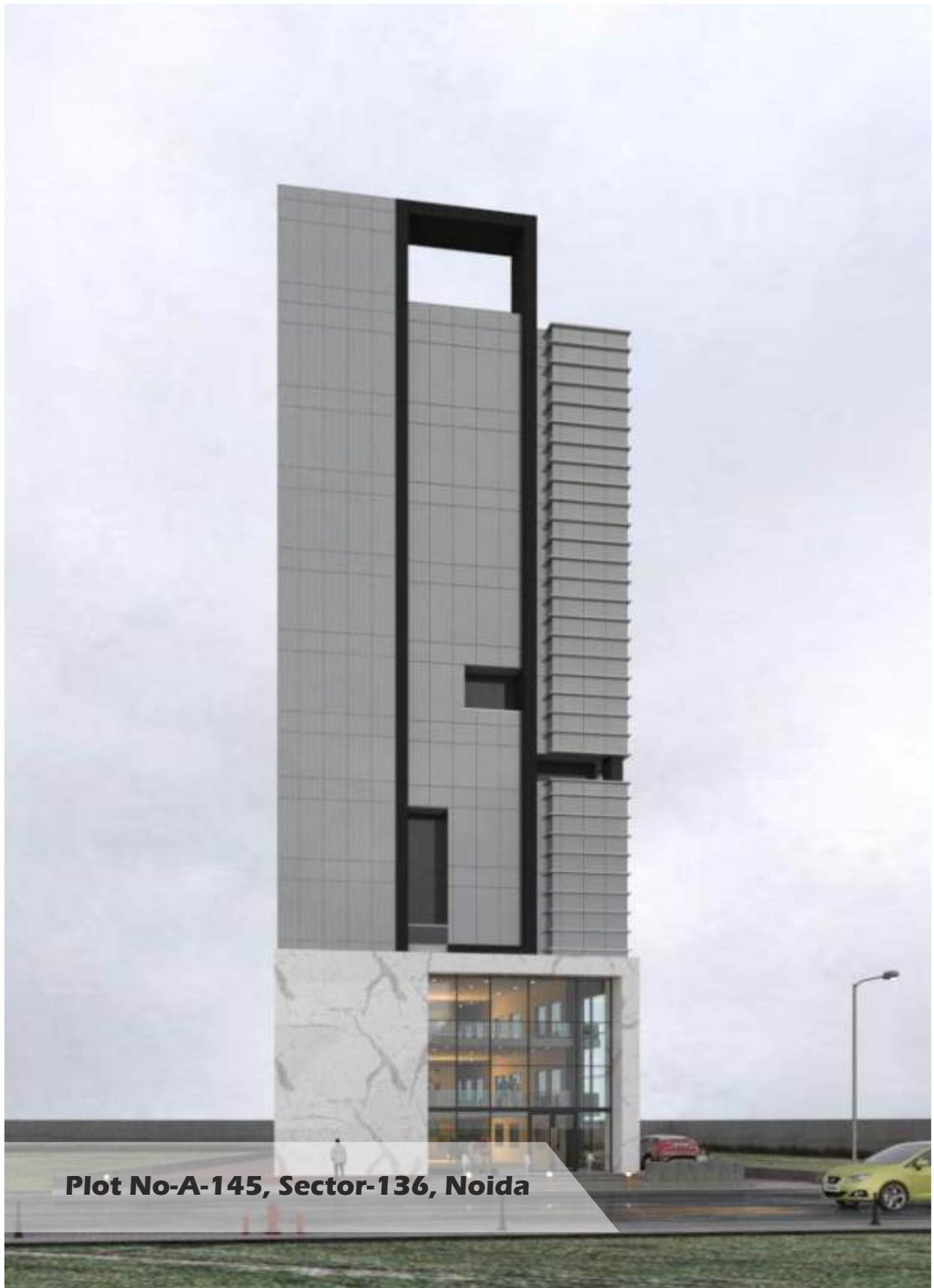
Plot No-A-145, Sector-136, Noida