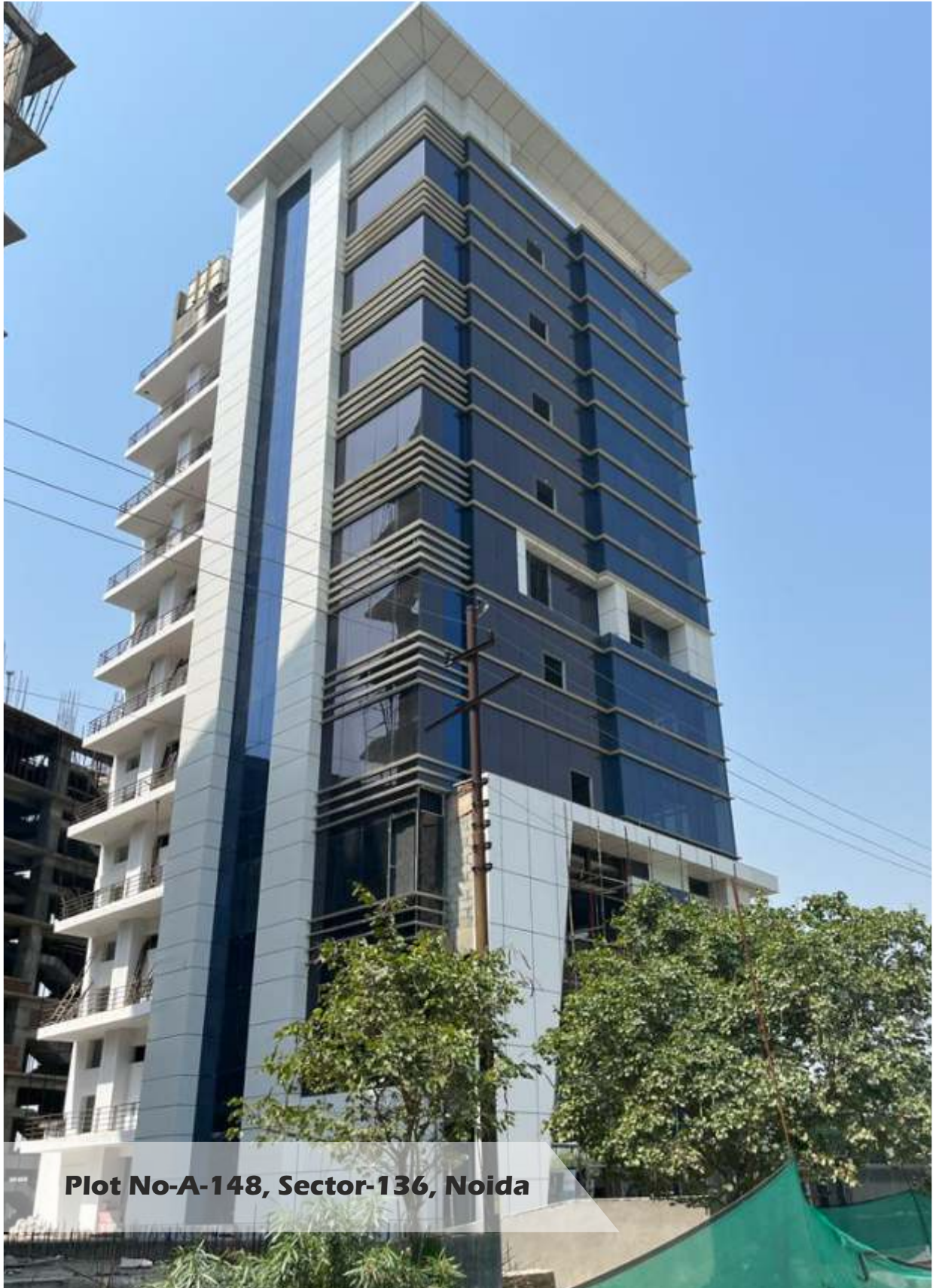
Plot No-A-148, Sector-136, Noida