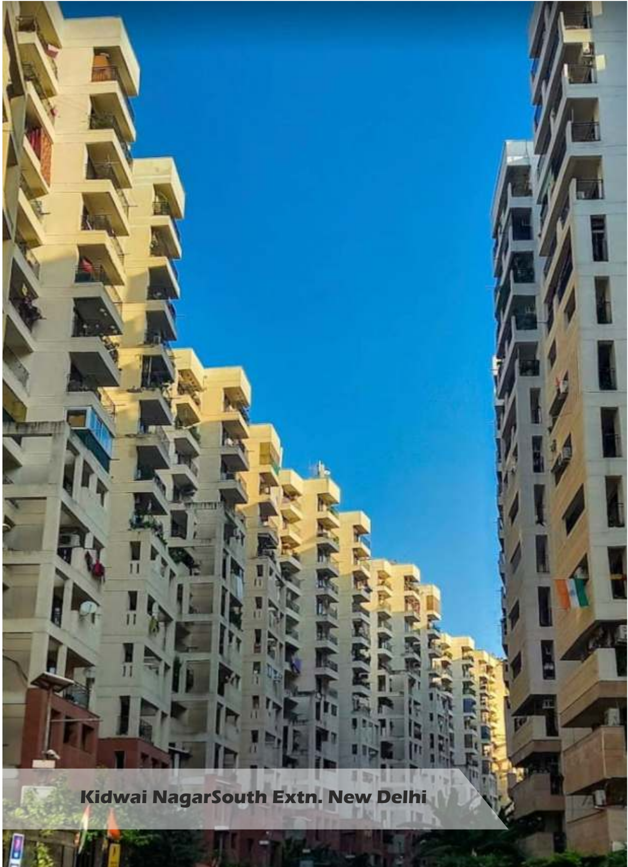
Kidwai NagarSouth Extn. New Delhi