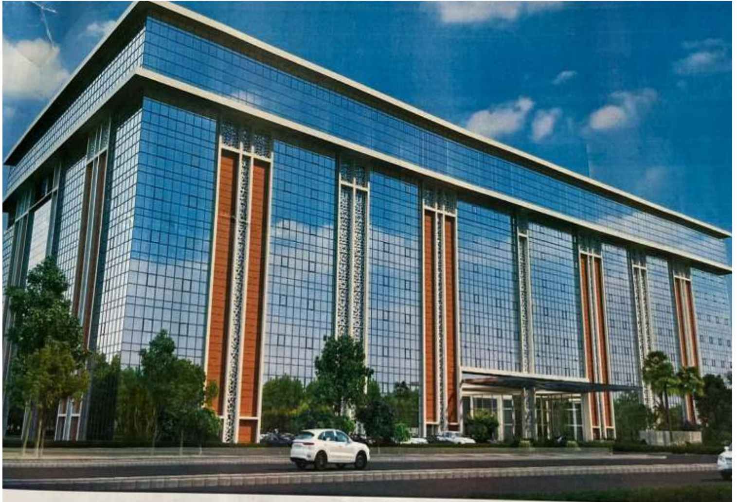
NBCC-Netaji Nagar GPRA Colony New Delhi