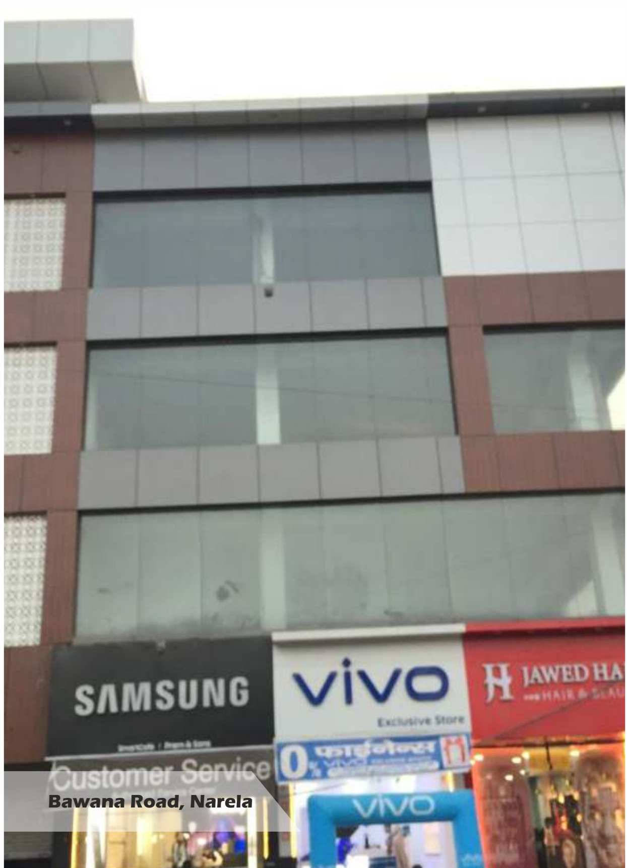
Bawana Road, Narela